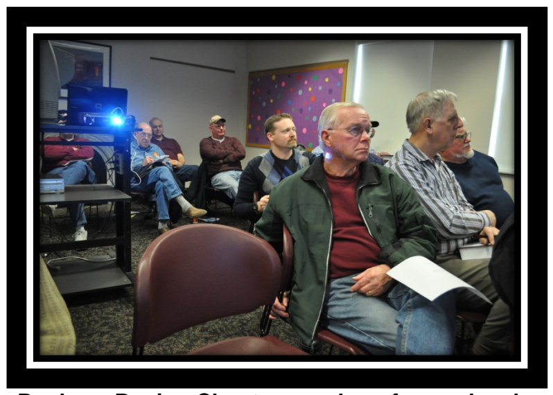
Buckeye Region Chapter members focus closely